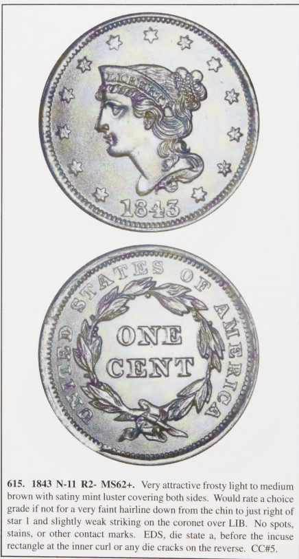
615. 1843 N-11 R2- MS62+. Very attractive frosty light to medium brown with satiny mint luster covering both sides. Would rate a choice grade if not for a very faint hairline down from the chin to just right of star 1 and slightly weak striking on the coronet over LIB. No spots, stains, or other contact marks. EDS, die state a, before the incuse rectangle at the inner curl or any die cracks on the reverse. CC#5.