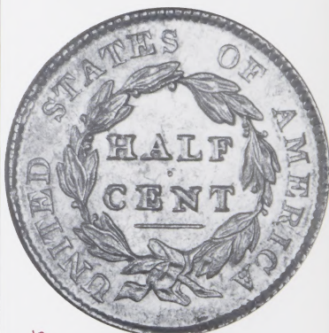
57. 1828 C-2 RI AU58+. 12-Star Obverse. Lustrous steel brown with a small swipe of darker steel toning through the 2 in the date. No contact marks, just the barest hint of friction on the highpoints from mint state. Excellent eye appeal. M-LDS, Manley state 3.0.