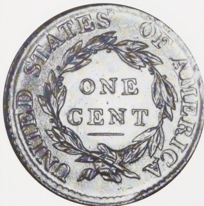
314. 1816 N-4 R2 MS62. Beautiful lustrous bluish steel brown with faded red in protected areas. No spots, and the only defect keeping this cent from a higher grade is a very faint hairline scratch in the field along the profile of the nose down to the field off the chin. This mark is difficult to see even with a good glass and knowing where to look. M-LDS. In the lower half of the condition census.