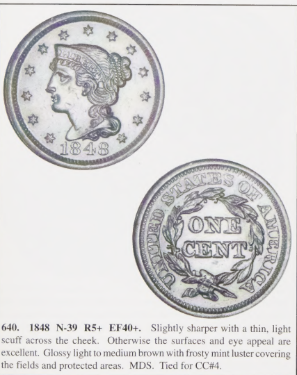
640. 1848 N-39 R5+ EF40+. Slightly sharper with a thin, light scuff across the cheek. Otherwise the surfaces and eye appeal are excellent. Glossy light to medium brown with frosty mint luster covering the fields and protected areas. MDS. Tied for CC#4.