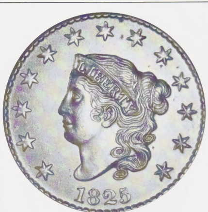
411. 1825 N-4 R3 F15. Sharpness VF20 or slightly better with too many light contact marks for the higher grade, including a dull, very light scratch from star 1 to the field before the lips and a scuff of very light hairline scratches across the cheek. Nice eye appeal for the grade in spite of the minor marks. Glossy chocolate brown. MDS.