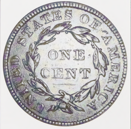
538. 1835 N-19 R5 VF20. Head of 1836. Very slightly sharper with a fine pinscratch at the dentils over stars 9-10 and a small group of tiny pinpricks at F-A. Nice glossy medium brown and chocolate, the brown tones delicately woodgrained on the reverse. The attribution points are clear. At the lower end of the condition census.