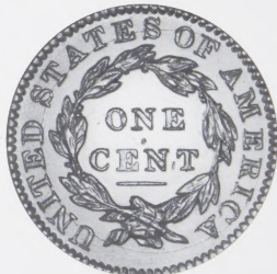
503. 1833 N-5 R1 AU58. Repunched 8. Glossy medium steel brown with frosty lighter brown toning covering the protected areas and hints of faded mint red on both sides. A few very tiny ticks on the face near the mouth and a light vertical nick between the N & T in CENT. Sharp EDS with smooth, reflective fields. The repunching on the 8 is crisp. Excellent eye appeal, very close to mint state.