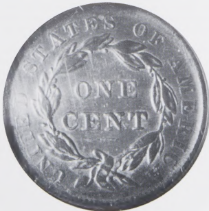
590. 1838 N-16 R5+ PCGS graded VF30. Sharpness VF35 net VF30 for a light cleaning. Now retoned a slightly glossy dark steel brown with some light brown toning in protected areas of the reverse. The only mark is a dull nick at the right base of the N in CENT. The surfaces are a bit dull but the planchet appears to be solid. This one looks like a good candidate for cracking and a little TLC.