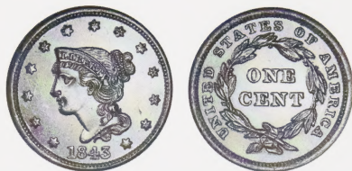
614. 1843 N-9 R2 AU55. Very close to mint state with a faint scuff at the throat and a nick on the chin, plus traces of an old fingerprint at stars 11-12. Attractive lustrous medium brown with bluish steel overtones on the reverse. LDS, die state c, with a tiny rim cud break between stars 1 & 2. The repunching on the 843 remains clear.