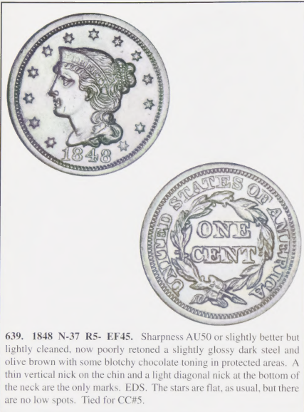
639. 1848 N-37 R5- EF45. Sharpness AU50 or slightly better but lightly cleaned, now poorly retoned a slightly glossy dark steel and olive brown with some blotchy chocolate toning in protected areas. A thin vertical nick on the chin and a light diagonal nick at the bottom of the neck are the only marks. EDS. The stars are flat, as usual, but there are no low spots. Tied for CC#5.