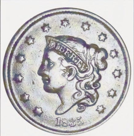
537. 1835 N-18 R4+ G4. Sharpness VF20 but heavily corroded. No verdigris or marks. The date and legends are clear. Dark olive and chocolate brown.