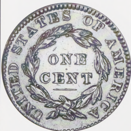
469. 1830 N-6 R4 VF35. Small Letters Reverse. Choice glossy light to medium brown with some frosty luster in protected areas from very fine die flowlines. No spots or stains, just a few minor contact marks, including a faint vertical scuff in the field right of star 5, a couple very fine hairline scratches near the dentils over star 12, and a diagonal nick above the O in ONE. MDS. A nice example of this very popular "Redbook" type.