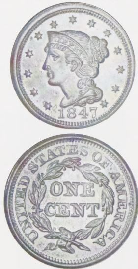
FINEST KNOWN 1847 N-6

626. 1847 N-6 R1 MS63. Bright original mint red fading to steel brown, about 60% of the red remaining on the obverse, 80% on the reverse. Would rate a slightly higher grade except for a few small spots of darker toning (not carbon), the most notable of these right of star 8 with a smaller one left of star 5. A very shallow low spot (caused by debris on the die) is in the field under the chin, plus there are additional low spots at ON in ONE and at the leaves under S-OF, all as struck. M-LDS, die state b. Tied for finest known honors with one other piece. Ex Bowers & Merena 1/25/90:1205-Wes Rasmussen, Superior 2/8/98:138-Chris McCawley-R. S. Brown, Jr., Superior 6/2/2002:363.