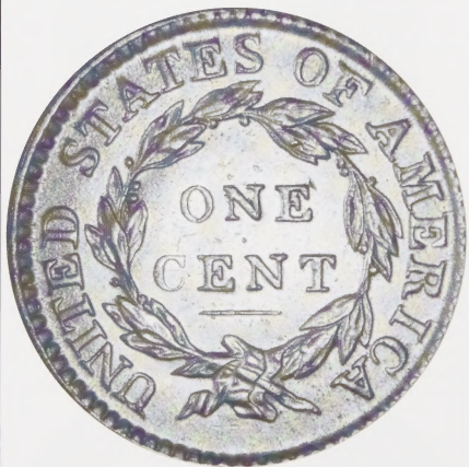
342. 1818 N-1 R2+ EF45. Frosty steel brown and chocolate. The surfaces are covered with fine die flowlines that create a satiny luster that covers the fields and protected areas. The only marks are a couple tiny pinpricks under the left side of star 7 and a thin vertical nick just left of the peak of the first 1. MDS with rim cud breaks from just above star 3 nearly up to star 5. The reverse is rotated 20 degrees CCW.