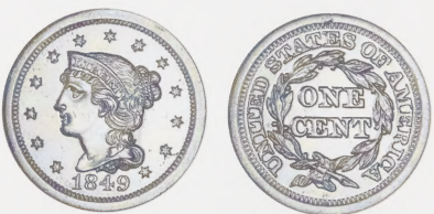
642. 1849 N-7 R4 EF45. Slightly sharper but lightly cleaned and expertly retoned glossy chocolate and steel brown. A few tiny ticks at star 12 and a planchet flake in the dentils over the E in STATES are the notable marks. E-MDS, die state b late.