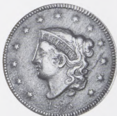
533. 1835 N-11 R4+ VG8. Rather glossy reddish brown with light brown highpoints and some darker chocolate brown toning in protected areas of the reverse. The only notable marks are a light rim bruise at the first T in STATES and another at OF. EDS.