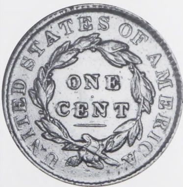
514. 1834 N-5 R5+ VF20. Large 8 and Stars with Small Letters Reverse. Double Profile. Five points sharper with too many light contact marks for the higher grade, including a hairline scratch from the right point of star 1 down to the dentils below and a rim nick at TE in STATES. Glossy medium brown and chocolate. There is a fine but clear double profile from the forehead down to the chin.