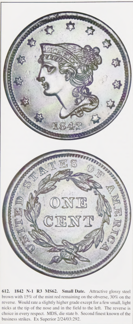
612. 1842 N-1 R3 MS62. Small Date. Attractive glossy steel brown with 15% of the mint red remaining on the obverse, 30% on the reverse. Would rate a slightly higher grade except for a few small, light nicks at the tip of the nose and in the field to the left. The reverse is choice in every respect. MDS, die state b. Second finest known of the business strikes. Ex Superior 2/24/03:292.