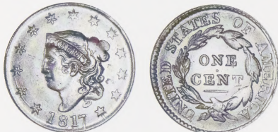
338. 1817 N-14 R1 AU58. Glossy golden light brown with bluish steel overtones. There is a hint of very light friction on the highpoints and the number "20" neatly written in black ink in the field behind the head. A spot of reddish brown toning is at the stem tip and a smaller one shows at the dentils left of the O in OF. LDS with the hairbuns and opposing leaves of the wreath softly struck. Most likely from the Randall Hoard of mint state cents. Ex Superior 2/7/2000:2086.