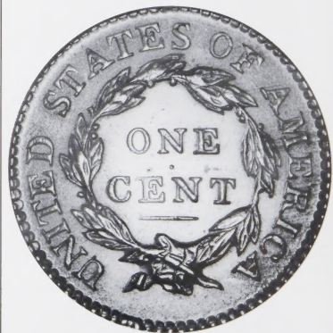
315. 1816 N-5 R3 MS60. Lustrous bluish steel brown with a few tiny specks of light reddish brown toning on the reverse. The surfaces are satiny and attractive, just a few light contact marks from choice. The notable marks are a dull vertical nick above star 1, a thin diagonal nick under the chin, and a dull nick on star 13. E-MDS.