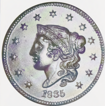
1835 N-8 EX HELFENSTEIN