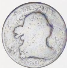
RARE 1802C-1 REVERSE OF 1800