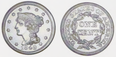
643. 1849/8 N-8 R2 AU58. So-called Overdate 9 over 8. Attractive frosty medium brown with satiny mint luster covering the fields and protected areas and traces of mint red on the reverse. No spots or stains, just a hint of rub on the highest points from mint state. Excellent eye appeal. E-MDS, die state b. The repunching (9 over 9 or 9 over 8) at the right bottom of the 9 is sharp and the rims are beveled. The reverse die is doubled, as usual.