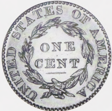
387. 1822 N-3 R2 AU55. Frosty bluish steel brown and chocolate with very faded mint color covering the protected areas of the obverse. The surfaces are lustrous and free of any spots or stains. The only notable sign of contact is a very light rim bruise right of star 9. MDS.