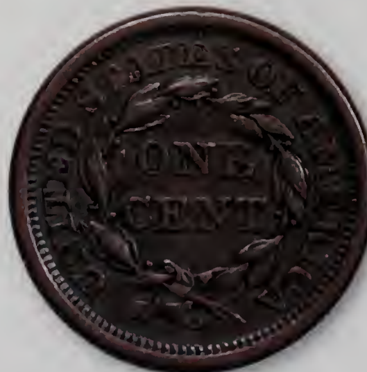
240. 1855 N-9 R1 VF30+ KNOB ON EAR. At least 10 points sharper. Too many minor marks, but nice light brown Color. E-MDS state of the Knob.