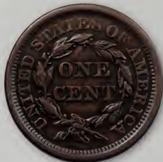
247. 1856 N-3 VF35 Pretty light brown to tan. Hard smooth surfaces. State g with the rim break at stars 12 & 13.