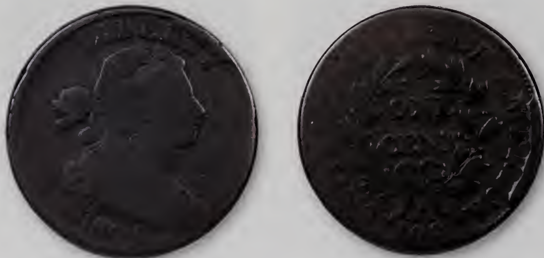
139. 1804 S-266c R2 G4 LDS with obverse and reverse cuds. Mostly smooth medium brown, but with two minor vertical hairline scratches on the portrait. The date is full and bold, and the reverse is full except from the typical weakness on the left side. LDS.