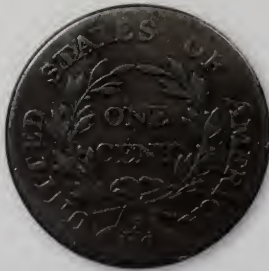
64. 1796 S-99 R5 VG8 Nice medium chocolate steel. Smooth surfaces. A couple tiny rim ties. Perfect EDS with mumps, but no die breaks. Ex. Jack Robinson Sale:178.