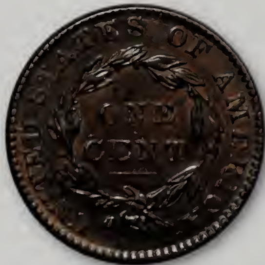
177. 1831 N-11 R2 VF35+ Nice steel and chocolate with traces of faded color. A little rub on the cheek and above Liberty's eye. A scarce die state with the crack above TES now a retained cud just prior to sinking.