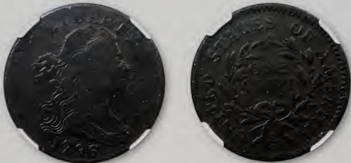
68. 1796 S-106 R4 NGC VG10 Dark steel with evenly granular surfaces. A couple old pinscratches, but the rims are clean and all the diagnostics sharp. Ex. Greg Hannigan-Adam Mervis.