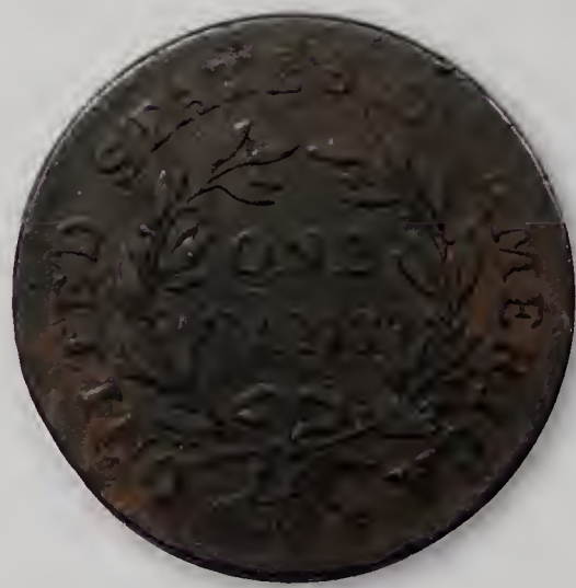
63. 1796 S95 R5+ VG10 Draped Bust, Reverse of 1795/1796 The color is a decent medium brown with maroon undertones, but the surfaces are lightly and evenly granular. There are also some tiny rim bumps on the reverse. Tied for CC#8.