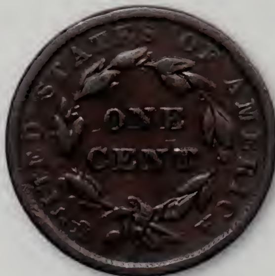
192. 1839 N-15 R6- F12 Medium tan to brown with a hard smooth surface. Very nice for the grade. Still very scarce. The diagnostics are sharp on both sides. Ex. EAC 2007:459.