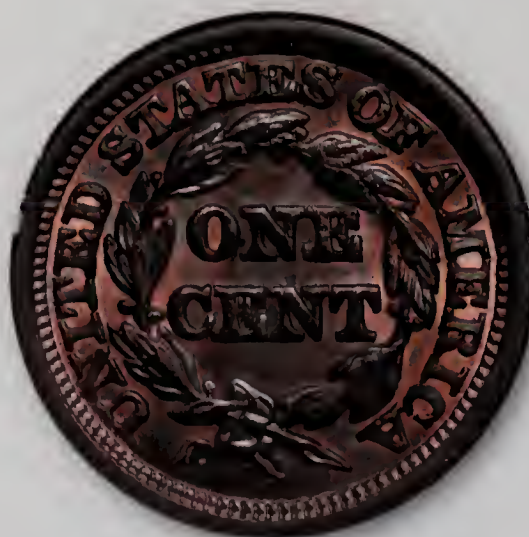
202. 1847 N-29 R3 NGC MS66 BN Frosty blue steel with deep mint red in much of the protected areas. Choice surfaces with attractive cartwheel luster, free of notable marks or detractors. MS64