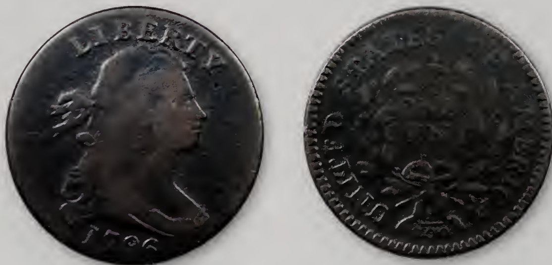
69. 1796 S-111 R5- G6 DRAPED BUST REVERSE OF 1794. CC#25. VG8 details with dark, "greasy" surfaces that are blurry from minor roughness and a possible smoothing. The obverse shows some fine scratches, and the reverse shows an even heavier grouping in the top right corner. Comes with a Grellman grading card "7+/6 MDS Breen III."