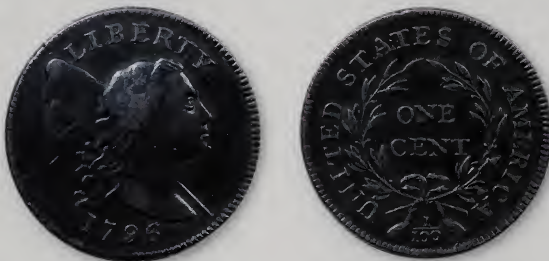
57. 1796 S-88 R4 VF25 VF30. Dark chocolate with a hard, smooth surface. Possibly waxed or "Sheldonized" at some time in the past. A couple marks in the field K8 obverse. Great eye appeal over all.