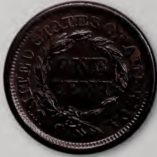
249. 1857 N-1 R1 MS60 LARGE DATE Frosty reddish brown. A few minor hairlines in the field. M-LDS.