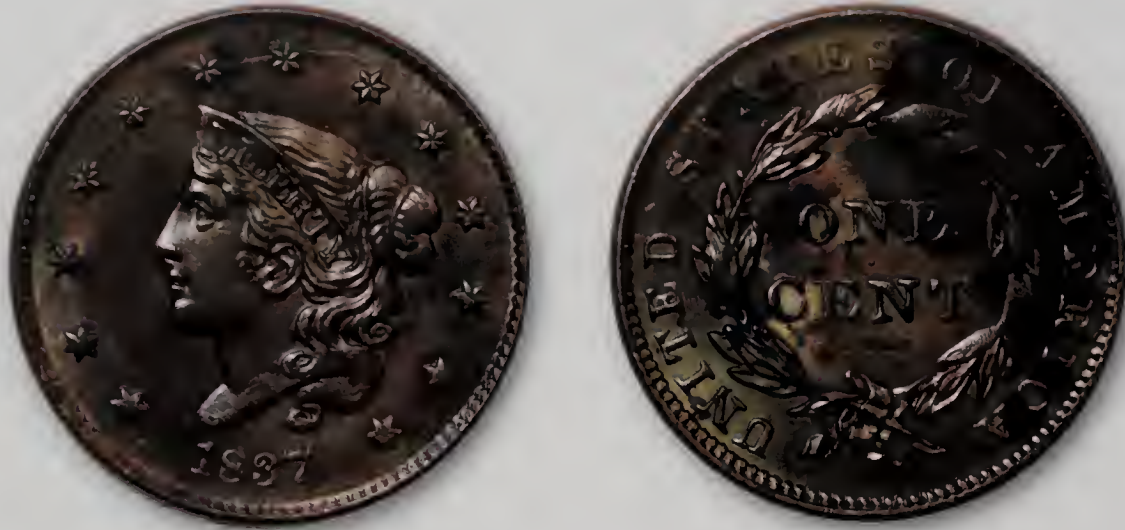
185. 1837 N-5 R2 AU58 PLAIN CORD. SMALL LETTERS REVERSE TYPE. Lustrous rose tan and steel. The reverse an uneven mix of tan and darker steel. Fully lustrous and certainly attractive in an appaloosa pony sort of way.