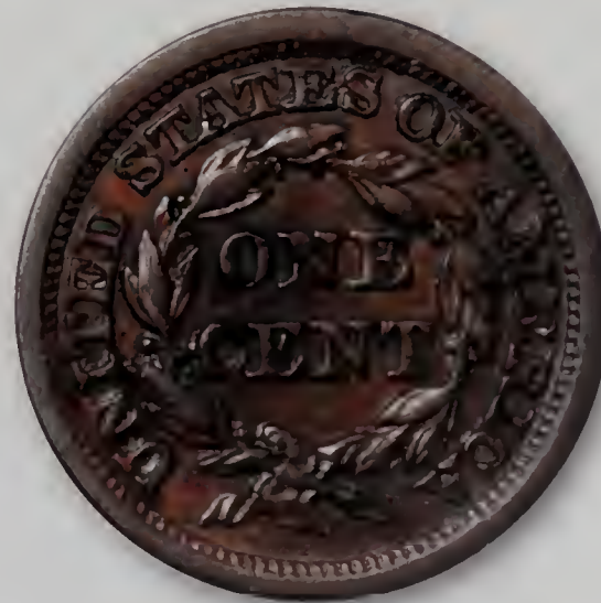
199. 1846 N-26 R5 VF20 VF30 Very pretty light brown color and hard smooth surfaces. Some old scratches in obverse field K4-5.