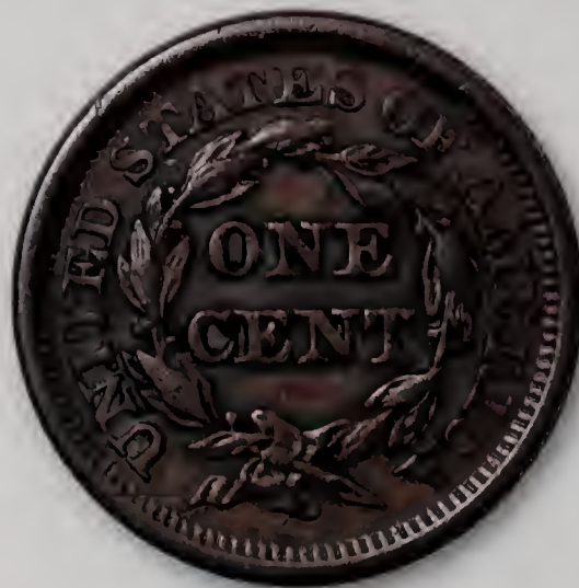
201. 1847 N-7 VF30 EF40. Nice light brown with a hard smooth surface. A few slight scratches and small marks reduce the grade. But eye appeal is decent. This is from the mid state of these dies "b" with a single obverse rim break at star one and the line down from dentils near star seven sharp. CC#4 of this die state.