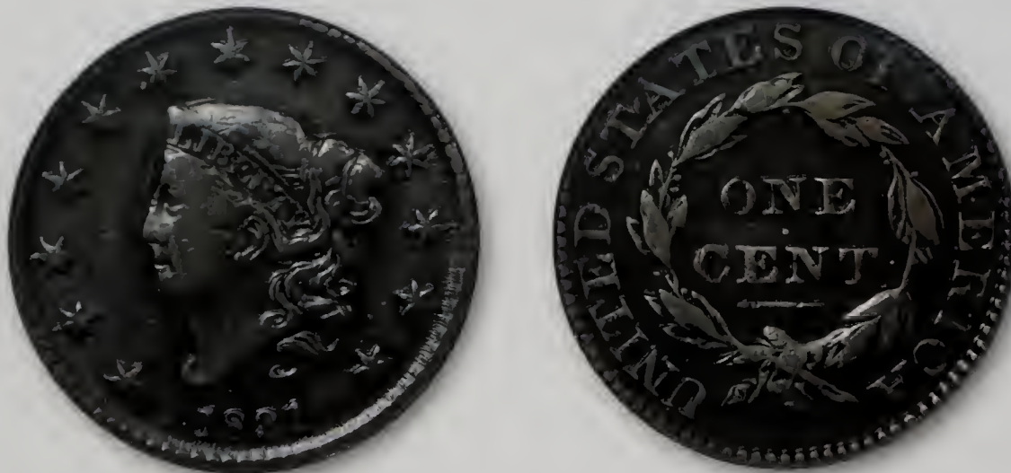
179. 1831 N-14 R4 NGC VF25 LARGE LETTERS DOUBLE PROFILE Free of notable marks or defects. Dark brown and olive in the protected areas. Smooth, attractive surfaces. Full Double Profile. VF20.