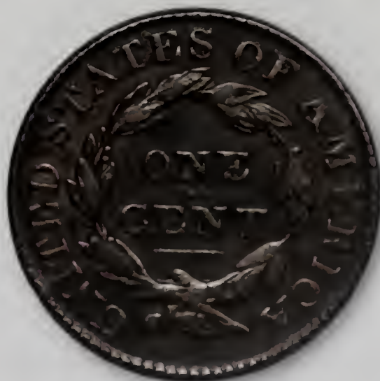
178. 1831 N-12 VF25 LDS. So called Harpooned Whale die state with massive cud at stars 12 & 13. Close to EF by sharpness, but some old graffiti in obverse field K9. Nothing's wrong with the cud though. Nice brown color with smooth surfaces.