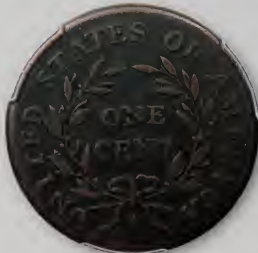
62. 1796 S-93 R3 PCGS Genuine VF Details Dark steel with reddish tan devices. Minute granularity and pitting. Sharply struck.