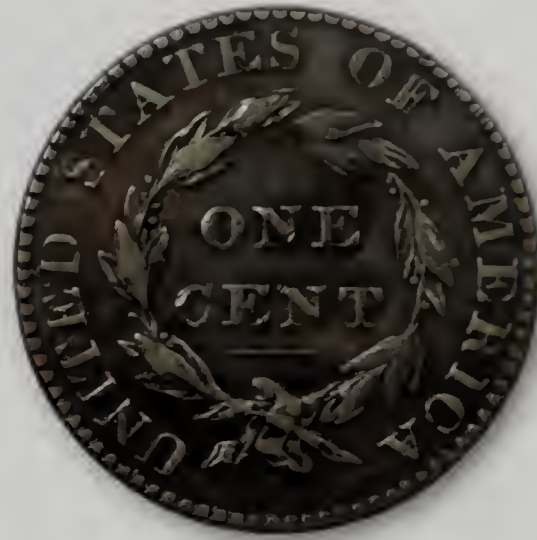
161. 1821 N-2 R1 VF20 Medium light chocolate. A couple small nicks hidden in Liberty's hair. Another right of star seven. A hard smooth planchet.