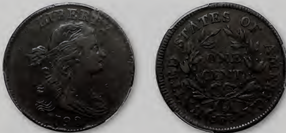
95. 1798 S-159 R3 VF20 FIRST HAIR STYLE CC#13. Glossy medium brown surface and details that are very bold and suggest a higher grade than VF25. MDS with a branch crack upper ribbon to top left of L joining crack along top of LIB, but with no cud at L. Ex. M & G Auction of the Ludwig T. Smith Sale 01/07/95:366.