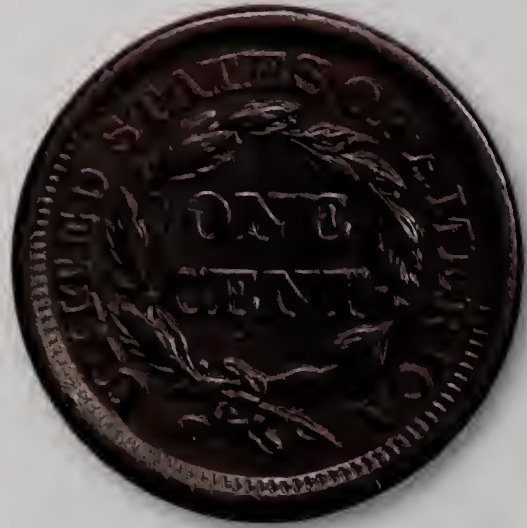
250. 1857 N-4 R1 EF40 SMALL DATE. Light chocolate brown with a hard smooth surface. Better than average strike with the tip of the coronet sharp.