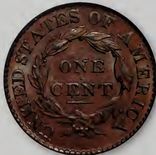
167. 1826 N-5 R2 NGC MS62 Very lustrous tan faded from mint red. Some light staining in front of Liberty's jaw. Maybe a trace of rub on the highest points of the reverse. Well struck. Small rim break above star six.