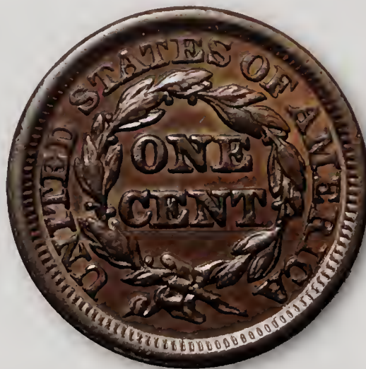
206. 1848 N-4 R4 EF40 Re-punched date 1848/1848. Five points sharper. Lustrous tan with a nick on the chin. Removed from an NGC AU50 holder.