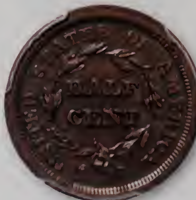
42. 1851 C-1 R1 PCGS MS63 Fully lustrous light brown. Early die state with the base of the misplaced one clearly visible.