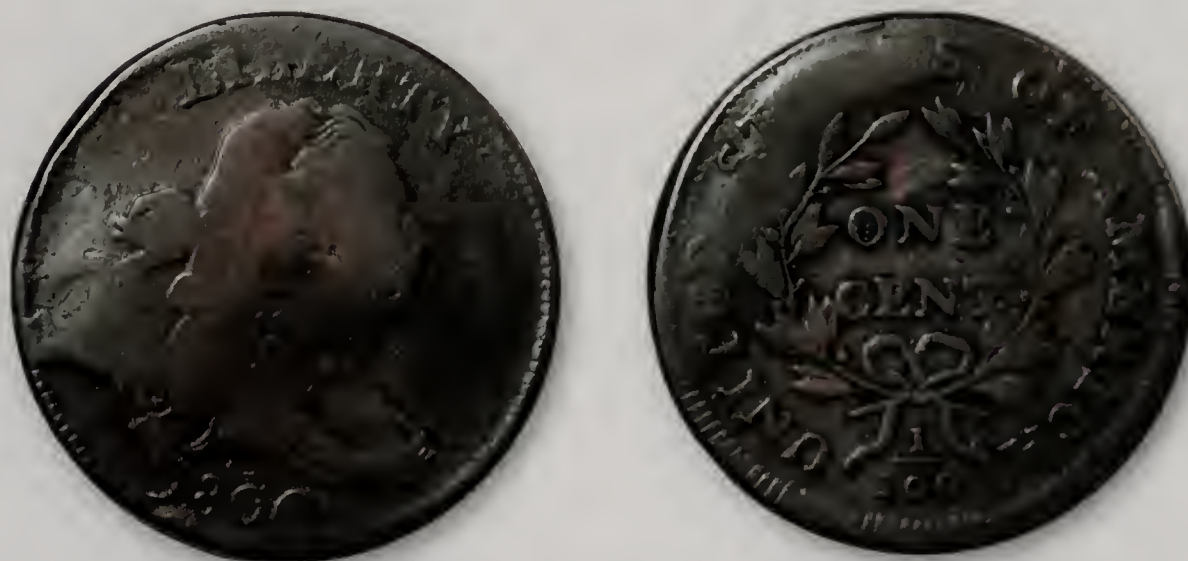
117. 1800 S-202 R4+ G6 Impressive late die state with significant swelling clash marks and the obverse die Crack K8. Probably recolored, but now a nice chocolate brown.