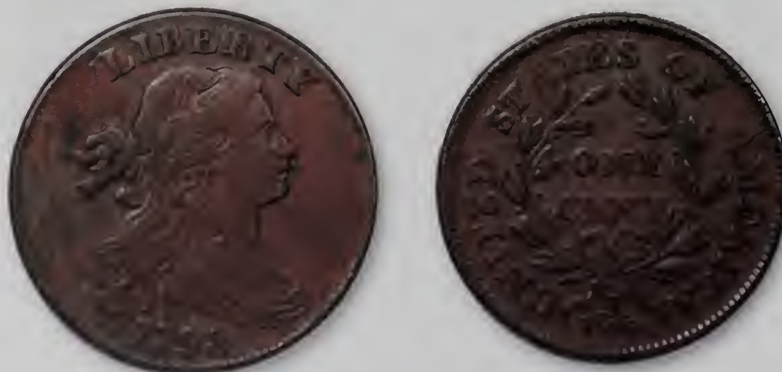
97. 1798 S-163 4 F12 FIRST HAIR STYLE CC#9. The entire coin has a maroon tint, and there are some areas of very minor roughness, plus some scattered contact marks. CC#9 and very attractive in hand. Die State IV with heavy blanking from below the lowest curl at rim to under 17. Ex. Stacks 01/17/06:1829