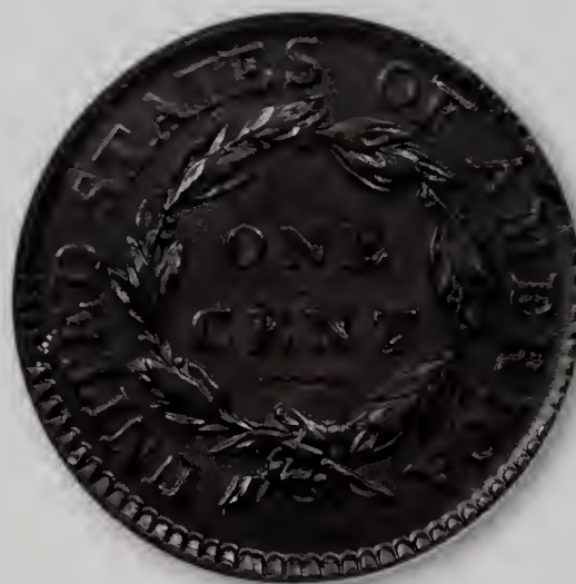
152. 1817 N-16 R1 PCGS AU53 15 STAR OBVERSE. Dark chocolate with a hard lustrous surface. Only trivial marks. A popular variety.