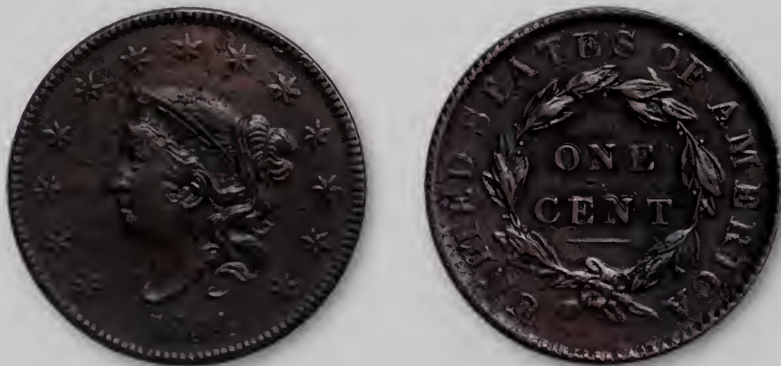
181. 1834 N-5 R4 F12 Sharpness EF40. Recolored walnut brown and chocolate. Some pitting and granularity reduces the grade. Ex. EAC 2006:362.