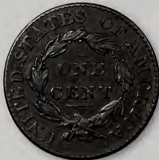
168. 1826 N-6 R2 VF30 Chocolate and steel. Possibly recolored but a mostly smooth surface with decent eye appeal for the grade.