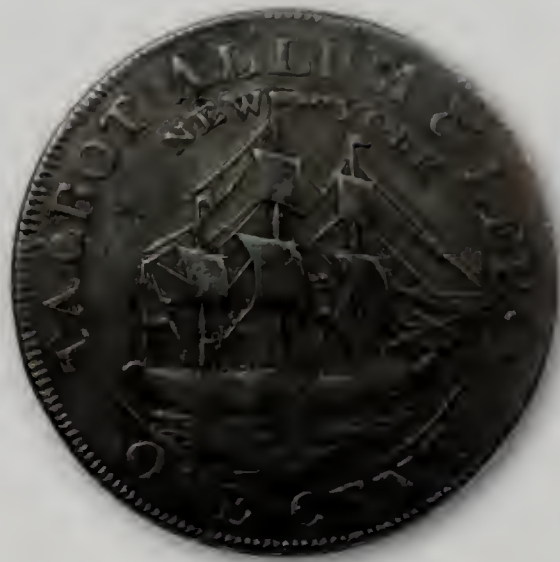
4. 1794 TALBOT ALLUM & LEE TOKEN VF20 Chocolate brown with hard, smooth surfaces. A small obverse carbon spot and a couple lamination voids as made.