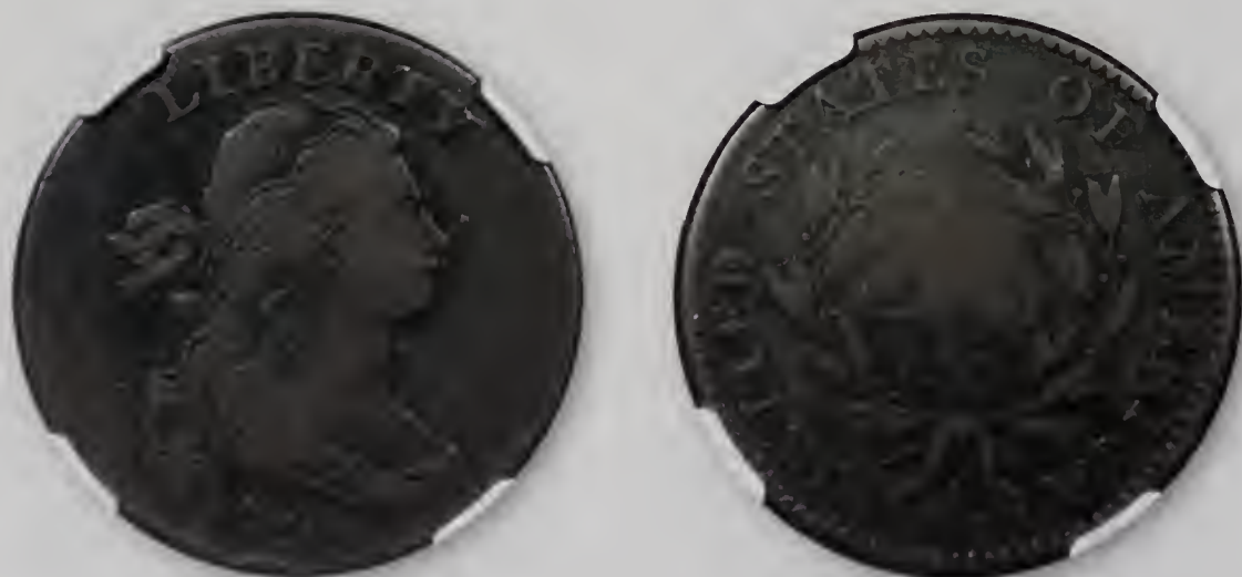
70. 1796 S-112 R4+ NGC F12 DRAPED BUST REVERSE OF 1794. CC#13. Original medium brown with strong details. There are a couple of minor rough patches here and there, plus a tiny nick or two, but overall this is a nice example. VG10