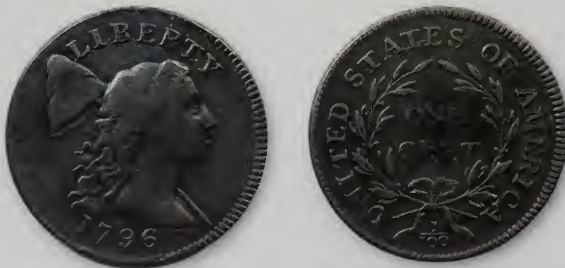
58. 1796 S-88 R4 F12 Sharpness VF25. Dark olive steel with some microscopic porosity and a few scratches Under the bust. Well struck for this variety with decent overall eye appeal.