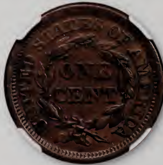
239. 1855 N-5 R5- NGC MS62 BN UPRIGHT 55 Lustrous chocolate and olive brown with traces of verdigris seen on the edges and protected areas of both sides. The notable marks include small hairlines on the cheek, neck, and between stars 3 and 4. The surfaces are pleasing and toning attractive. Upright 55. AU55