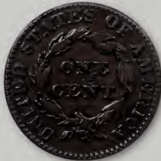
162. 1822 N-9 R5- G6 Dark brown. Sharper and appears glossy but the surfaces have been wheeled. Small rim bruise at star one.