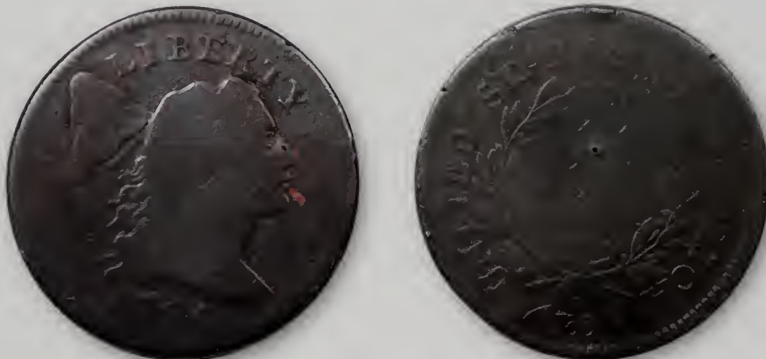
56. 1796 S-85 R5- AG3+ G5 sharpness. Cleaned and retoned a bluish steel and brown. A small pinprick center at l reverse