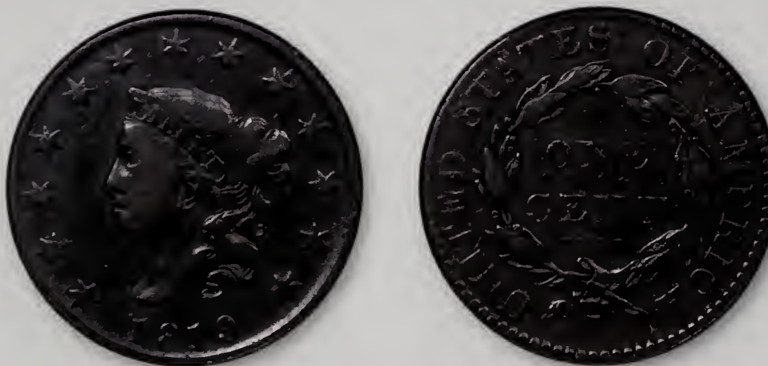
159. 1819 N-7 R4 NGC VF25 Chocolate brown. Some field marks. Ex. EAC Sale 2010:327. Could benefit from being broken out and brushed. F12.