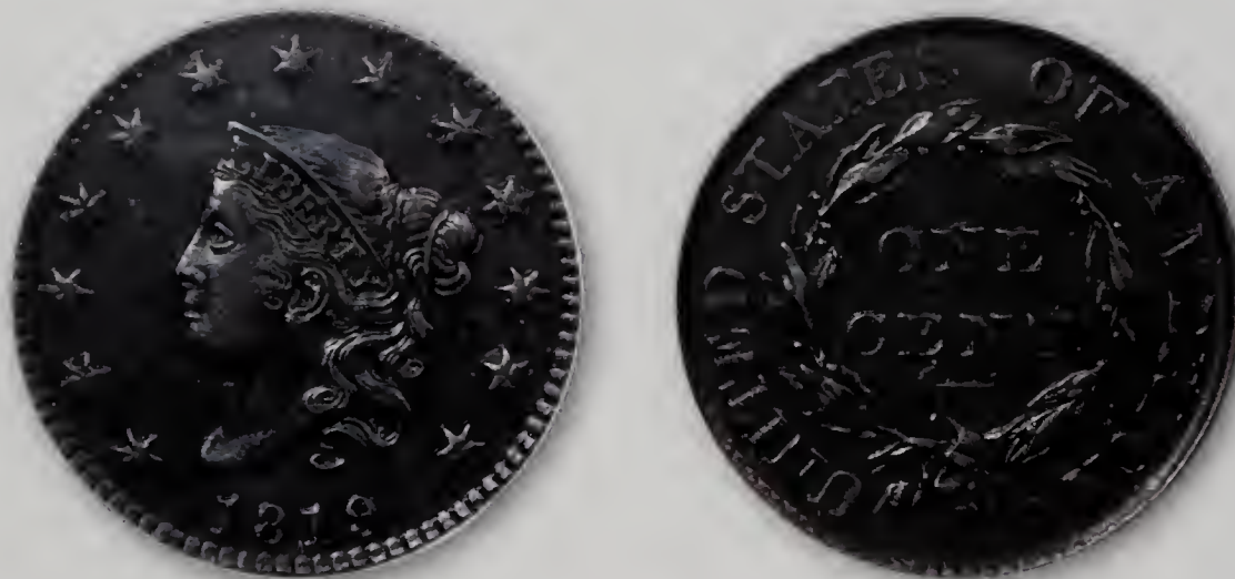
158. 1819 N-5 R3 ICG XF45 Dark steel color with a minutely granular surface. But quite sharp with good eye appeal. Quite scarce in this condition. VF30.