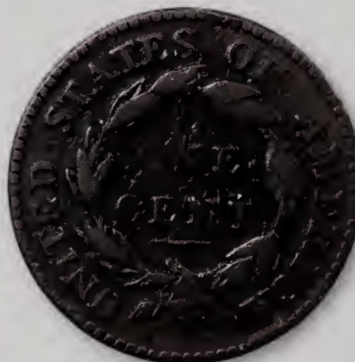
153. 1818 N-4 R4+ VG7 Several points sharper. The bulging of the obverse die makes technical sharpness hard to determine. Nice brown color but some reverse scratches detract.