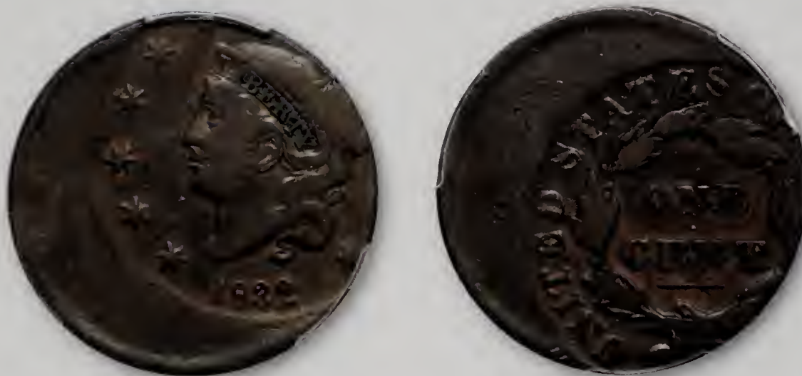
180. 1832 PCGS F15 MINT ERROR 30% OFF CENTER Medium olive brown with lighter brown and reddish brown in the protected areas. Struck 30% OFF CENTER. The most notable mark is seen above ED in UNITED, with minor marks and pinscratches seen across the field and devices of both sides.