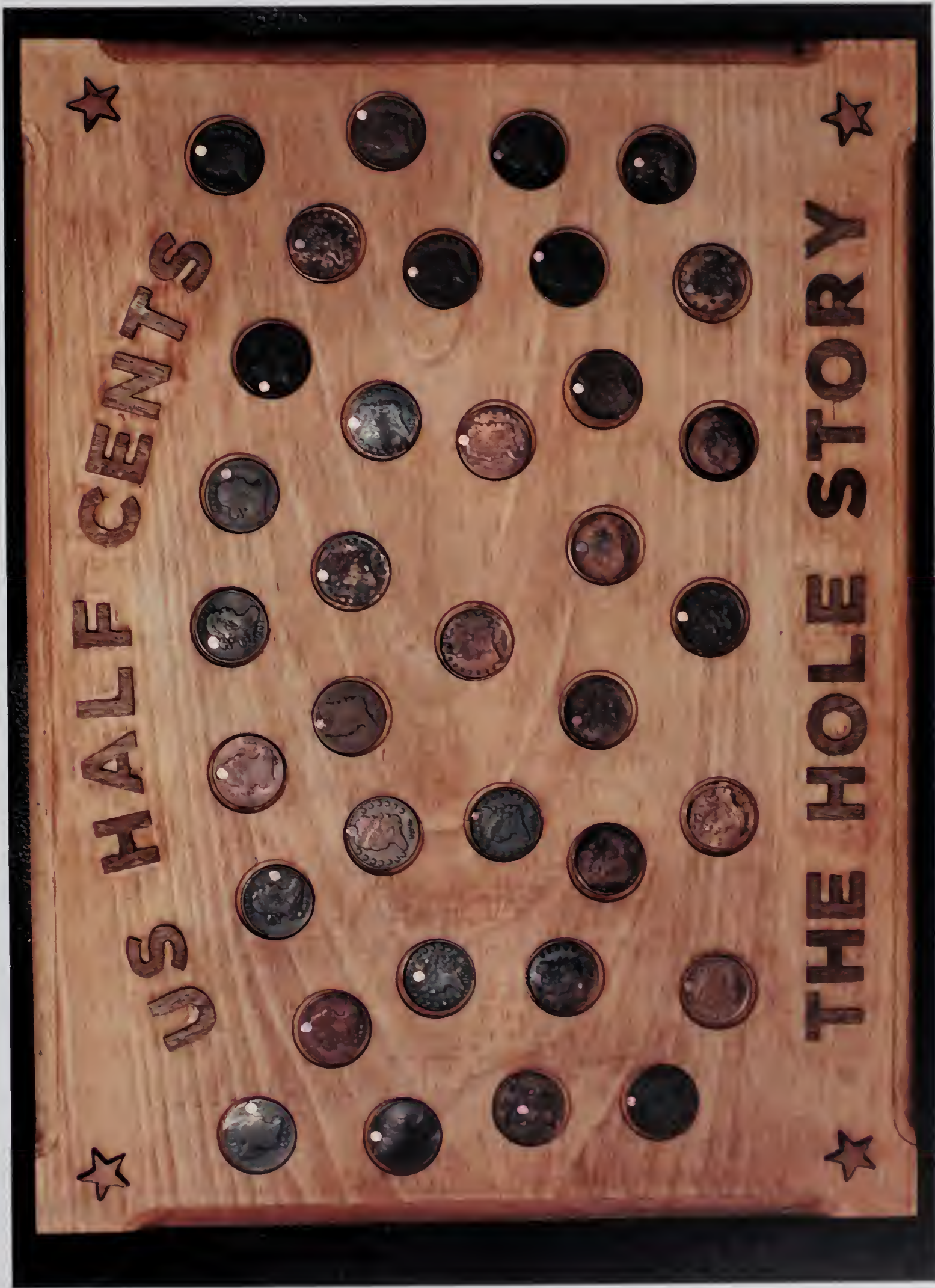
43. HOLED HALF CENT COLLECTION A fabulous collection of holed Half Cents of various dates and varieties from 1795 to 1857. Includes an 1808/7 and 1811 I presume to be real, an 1831, an 1852, and an 1836 I presume to be copies. All presented in a custom made board, "The Hole Story". 35 pieces. A great conversation piece. Must be examined!