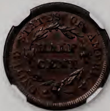
40. 1850 C-1 NGC MS61 Light chocolate with some mint red across the devices. There are some scattered marks, but sharply struck. The grade seems a little stingy by NGC standards. Deserves to be broken out and brushed.