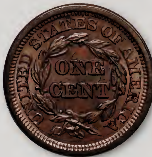
207. 1848 N-23 R3 MS60+ There is some light staining on Liberty's face and neck and a microscopic hairline scratch from star one across the portrait left of Liberty's ear. But the deductions are trivial compared to the eye appeal. Lustrous tan with splashes of original mint red. Surely among the top six examples.