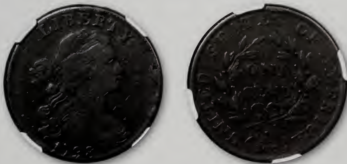
110. 1798 S-187 R1 NGC VF25 SECOND HAIR STYLE Too many light nicks and rim bumps. Original, dusky brown color with very sharp details. Die state B with cracks and heavy cuds in front of face and reverse cracks at ribbon and ICA.