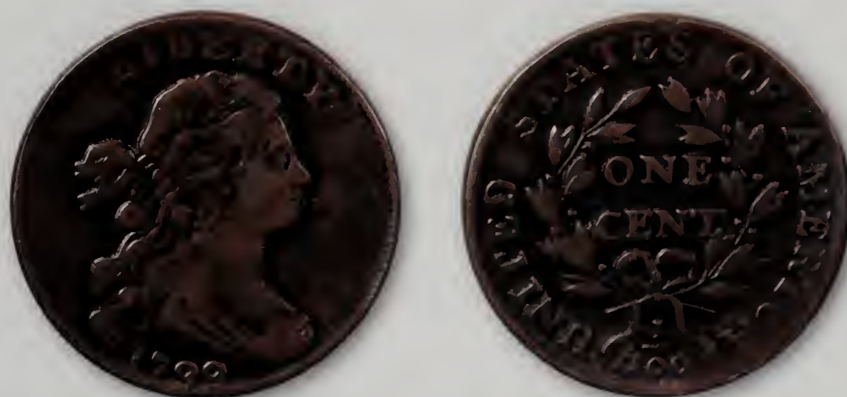
111. 1799 ELECTROTYPE COPY A nicely executed and cleverly done electrotype copy. The reverse features all the Diagnostics of an S-174.