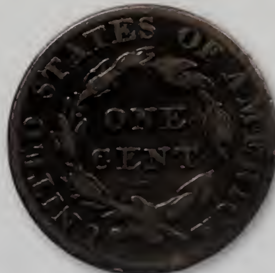
163. 1824 N-5 R4 VG7 1824/2 Chocolate with tan devices. Smooth surfaces. A couple ties but nice for the grade. Scarcer of the two overdate varieties.