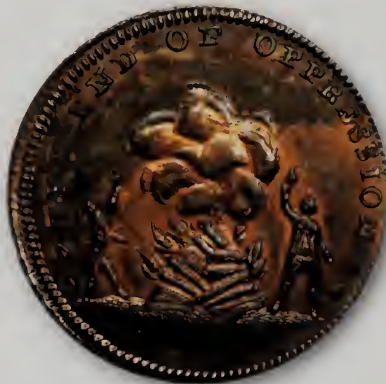
5. 1790 MIDDLESEX/SPENCE MS65 A lounging shepherd appears to bear a 1790 date. A consuming bonfire "the end of oppression". DH 825.