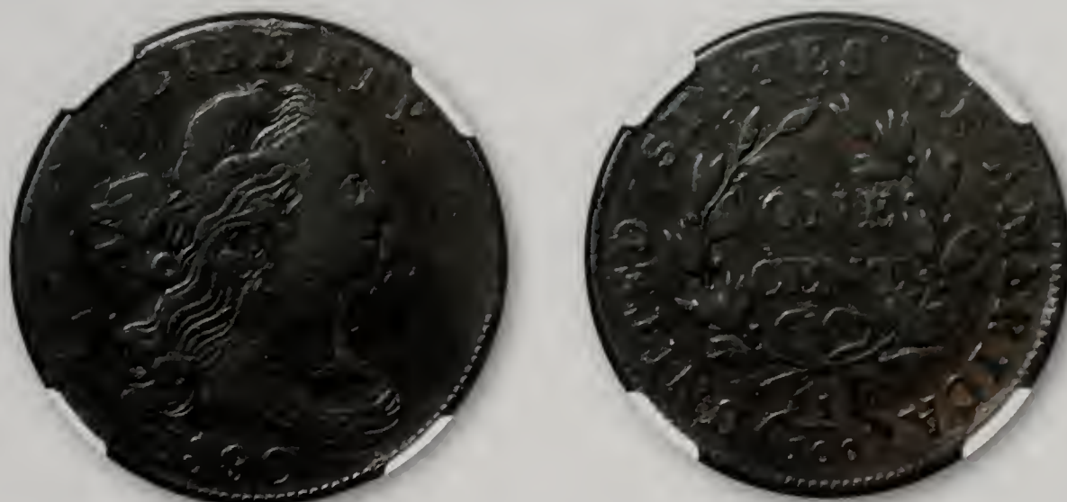
116. 1800/79 S-193 R4 NGC F15 OVERDATE WITH SECOND HAIR STYLE Strong details and the color is a very nice, glossy chocolate brown. There are a couple of rim nicks at the top of the obverse, but overall this is a very nice example of an R4 Redbook variety. Die State B with a light reverse die crack at the fraction. F12.