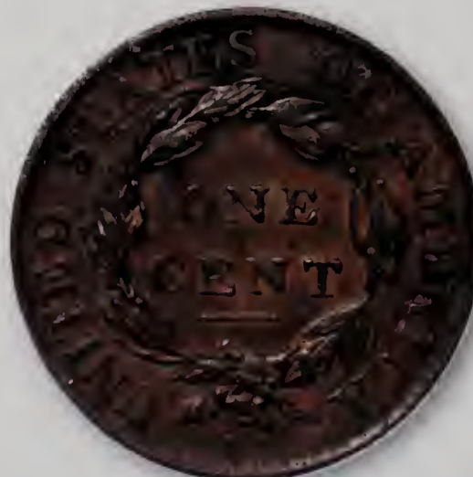
154. 1818 N-6 R1 PCGS XF45 There are minor marks seen on the cheek, bust tip, and fields, with a fine scratch along the edge over stars 9 and 10. There is also dark verdigris seen in the fields and protected areas. Light brown and attractive tan. There is a fine die break seen wrapping around from ED in UNITED under STATES OF over to AM in AMERICA. VF35.