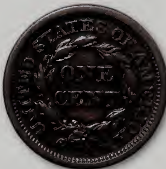
198. 1846 N-23 R5 VF20 Ten points sharper. Chocolate with some evidence of old cleaning. Some scratches at the 4 of date.