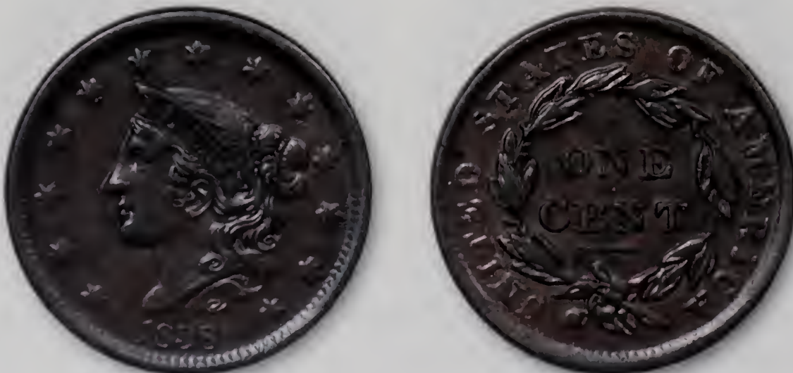
187. 1838 N-11/13 R2 EF40 CORONET Glossy medium brown surfaces with subtle mint frost on each side. No marks or distractions of any consequence, just a few spots of darker color mixed into the toning and a couple miniscule contact marks. MDS. (N-13) with lapped, partially flowlined surfaces, but without the obverse break.