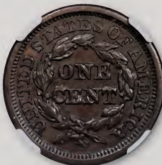
208. 1848 N-25 R4 NGC AU58 Light chocolate and olive blend with incredibly microscopic porosity, only visible under a glass, that doesn't detract from the appeal. The notable marks include a small dig above the eye, and a mark on the rim above star 8. There is a small die break seen faintly extending from the leaf above O in ONE. EF45.