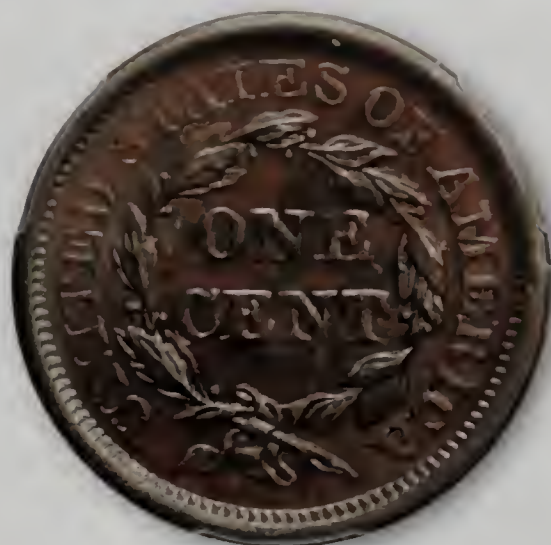
246. 1856 N-2f R1 PCGS MS63BN SLANTED 5 Deep bluish steel brown with some reddish tan toning around the obverse peripheries and much of the reverse. Quite lustrous and the sharpness is mint state, but the color suggests this cent was likely dipped a while back and has since retoned. An attractive coin regardless and very clean surfaces. LDS, state f, with clear obverse die cracks and a weak UNITED STATES.