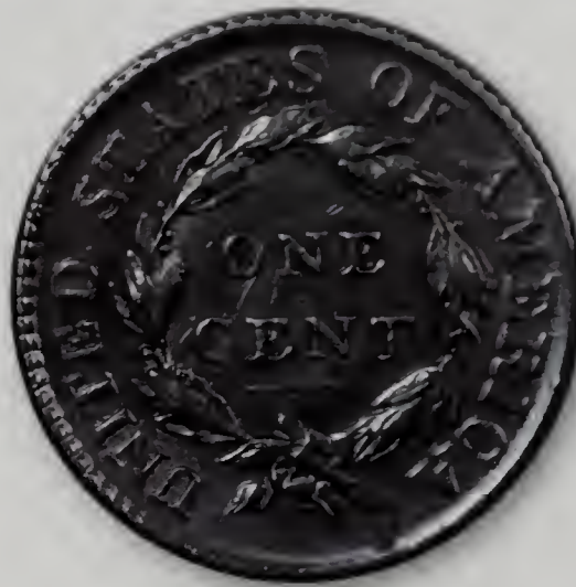
149. 1816 N-8 R3 VF30 EF40. Bluish chocolate and brown. A small scratch under O of ONE. Almost certainly cleaned and retoned but looks ok now. MDS with two rim breaks.