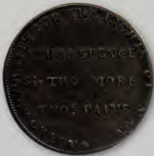
6. MIDDLESEX/SPENCE AU55 "pigs meat". A pig tramples the symbols of authority: a pope's mitre and a king's crown. Modestly inscribed "Thomas Spence, Thomas More, Thomas Paine".