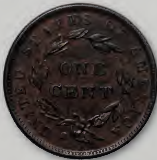
191. 1839 N-14 R3 EF40 BOOBY HEAD. Light chocolate steel with hard, lustrous surfaces. Minor hairline scratch up from star one into field.