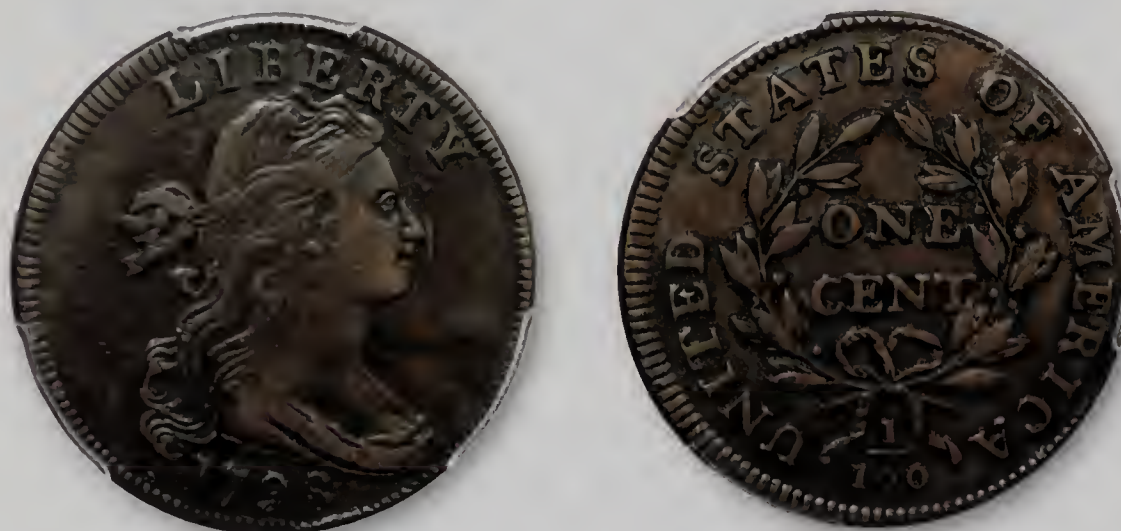
96. 1798 S-161 R2 PCGS VF35 FIRST HAIR STYLE There are a couple hairline scratches on the reverse seen over and below OF, blended in well, a pin point sized mark left of the date, with trivial marks and traces of light pin scratches on the fields and devices otherwise. Medium brown, dark brown, and olive blend with a light scuff in front of the nose showing a lighter brown. First Hair Style variety with a thin lamination in the field near K4, a die break right of UNITED and a couple more delicate breaks above STATES. The surfaces are smooth and attractive. VF30.