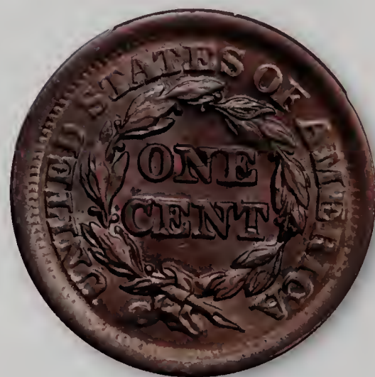
233. 1852 N-12 R1 PCGSMS64 Brown with bluish green overtones and just a touch of mint red. MDS.