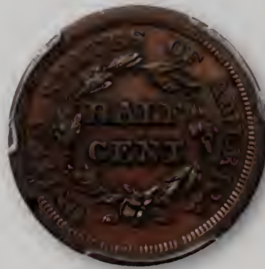
39. 1849 C-1 R2- PCGS MS62 Light brown. Sharply struck . Couple tiny rim marks. Nice color.