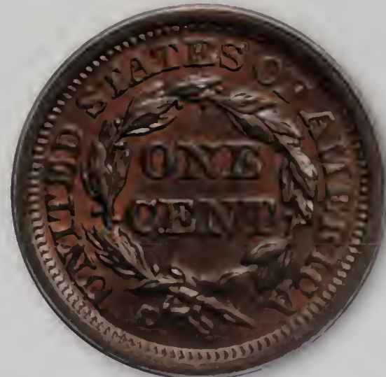
248. 1856 N-7 R2 PCGS MS64 UPRIGHT 5. Deep glossy chocolate brown splashed with original mint red. A great looking cent.