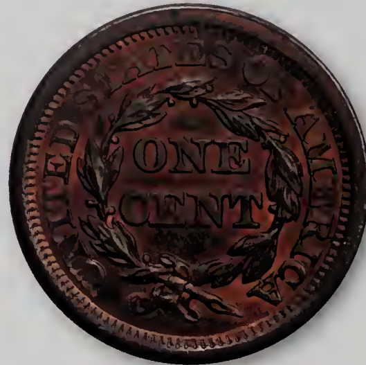
238. 1855 N-4 R1 MS62 UPRIGHT 5s. Bright mint red and steel. A couple abrasions in the obverse field K8. Good eye appeal.