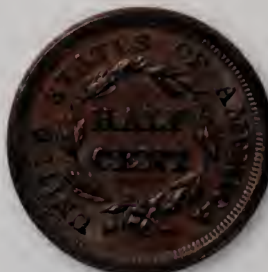
41. 1851 C-1 R1 AU50 Lustrous light brown.