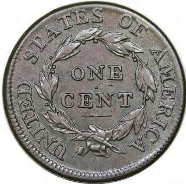
112. 1812 S-291 R2 XF40. Small Date. Glossy steel brown and dark chocolate. Smooth, hard surfaces and only trivial marks. Sharp detail that is solidly XF and has traces of frosty luster in the stars and legends. An excellent example. Nicely struck M-LDS, Breen III early.