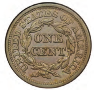
183. 1849 N-10 R3 NGC MS63BN. EAC AU55. Frosty light olive brown surfaces with just a little rub on the high-points. Scratch between stars 3 and 4 is the only mark worthy of note. Excellent grade for this variety. M-LDS (c), the obverse fields are rusted and sinking and the lump on the coronet is fully developed.