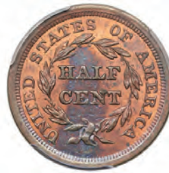
40. 1857 C-1 R1 PCGS MS62RB. EAC MS62. Nice mint state example of this popular last year of issue. 10% mint red on the obverse and more than 50% on the reverse. Full cartwheel luster and original skin.