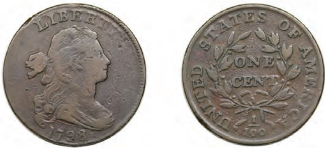
80. 1798 S-169 R3 VG10. Style 2 Hair. A nice medium brown cent and close to Fine. There are just some scattered contact marks and a rim nick before the L.