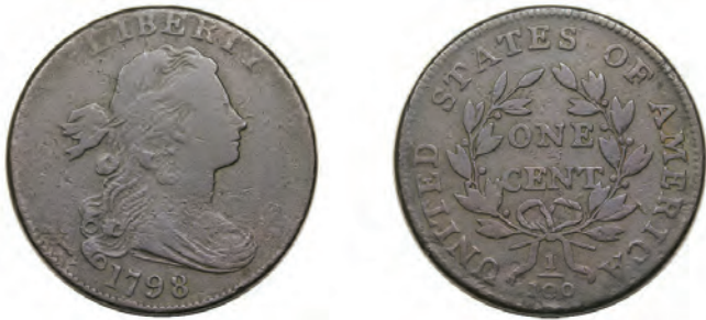
81. 1798 S-172 R2 VG7. Style 2 Hair. Sharpness near F12 but portions of the gray-brown surfaces are rough, mostly across the bust and the lower reverse border. Scratches on the hair and nose. Strong date and legends.