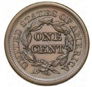
185. 1850 N-15 R2 AU50. Essentially unworn but lightly cleaned and recolored to a nice chocolate brown with just a trace of orange. Obverse pristine in terms of marks, the reverse nearly so. Sharp EDS (a).