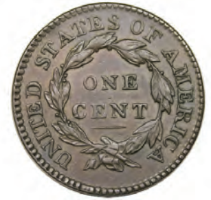
114. 1816 N-6 R2 XF45. Attractive medium brown with frosty tan in some of the protected areas. Cartwheel frost in the fields and only light wear, very close to AU. Just a few trivial contact marks in the left obverse field. E-MDS.