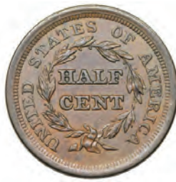
39. 1856 C-1 R1 AU50. Attractive, original, light brown surfaces and an above average strike.