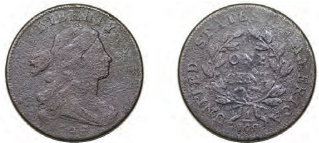
84. 1799/8 S-188 R4 AG3. Fine or better detail but fuzzy in appearance from even granularity covering both sides. Dark olive and steel brown. The only mark is a scratch on the brow. Just about all of the date can be made out when viewed at the proper angle. An authentic and easily attributable example of the scarce overdate variety of the most famous large cent date.