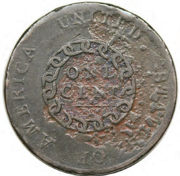
41. 1793 S-3 R3- VG8. Chain, AMERICA. Here is an intriguing Chain cent. Hard, glossy dark brown surfaces everywhere except for half of the reverse where the surface shows ancient erosion and a bubbly brick red and orange-brown patina underneath. Given the even wear pattern and glossy texture throughout, it's clear the planchet obtained this peculiar characteristic very early in its life, perhaps even before leaving the mint. Aside from all this, the coin is quite pleasing as an example of our first cent, with solid F+ detail including a full date, complete legends, and much of the fine hair detail remaining. There are some marks – scattered rim bumps, a few obverse scratches, and reverse scrapes – but no roughness on the obverse. Faces up nicely. MDS, Breen II, and the clash-marks are well-displayed on the smooth obverse surface.