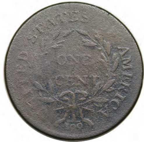
1798 S-178 R5+ VG7. Reverse of 1795. A very respectable example of this key Sheldon number and the only combination of a Style 2 Hair obverse with the Reverse of 1795. Dark olive and steel surfaces are granular yet still fairly glossy. Two marks near the hair ribbons, otherwise unscathed. Full Fine sharpness showing a considerable amount of detail including full reverse legends. Should easily rank in the top dozen of the variety. LDS, Breen IV. Ex 2008 EAC Sale, lot 312.