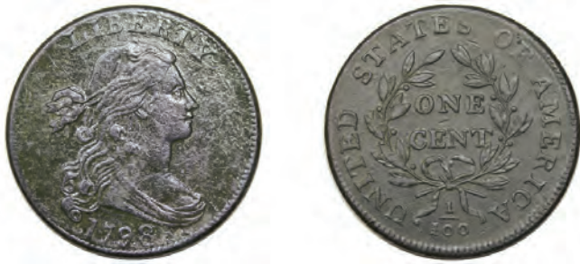
79. 1798 S-167 R1 F12. Style 2 Hair. Sharp XF detail but very dark with some rough greenish patina. The obverse is glossy from a sort of lacquer on the surface while the reverse is more matte. E-MDS.