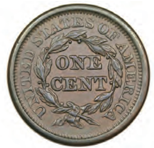
184. 1850 N-4 R1 XF45. Attractive chocolate brown and steel. Traces of luster and close to AU. Few nicks on the portrait and scratch between stars 10 and 11. LDS (c).